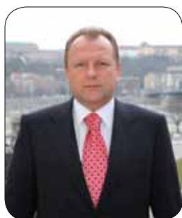
Marius L. VIZER IJF President